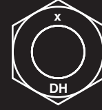
A 563 Grade-DH