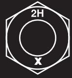
A 194 Grade-2H