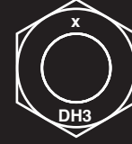
A 563 Grade-DH3