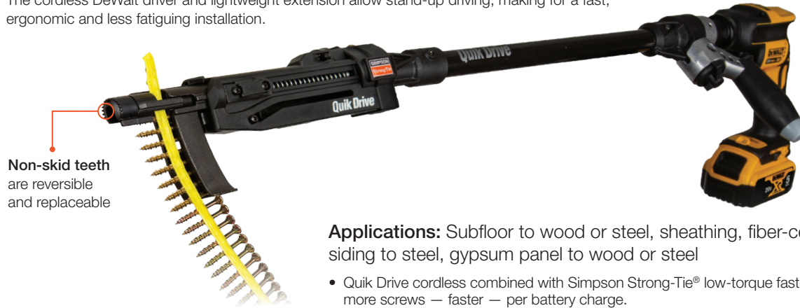
Non-skid teeth are reversible and replaceable

The Quik Drive® PRO200SG2 Cordless Multi-Purpose System is a complete auto-feed screw driving tool powered by a 2,000 rpm, 20V cordless DeWalt® brushless driver motor. Eliminate the need for cords, compressors and generators to run with this best-in-class, ergonomic fastening system. Subfloor installations are fast and easy using this lightweight, portable Quik Drive system. The cordless DeWalt driver and lightweight extension allow stand-up driving, making for a fast, ergonomic and less fatiguing installation.