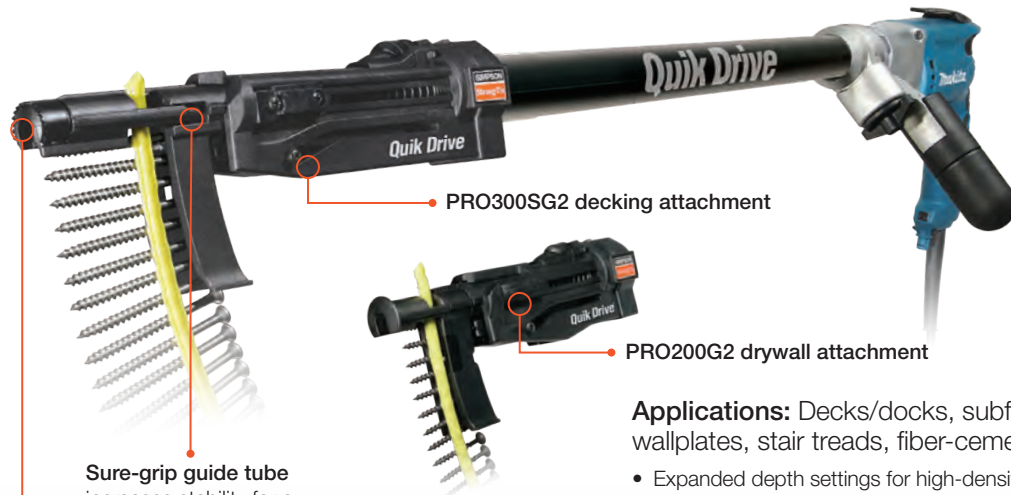
PRO300SG2 decking attachment