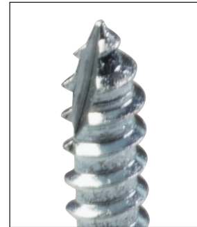
Type-17 point for use in wood