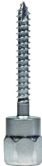
RWV Vertical Wood Rod Hanger