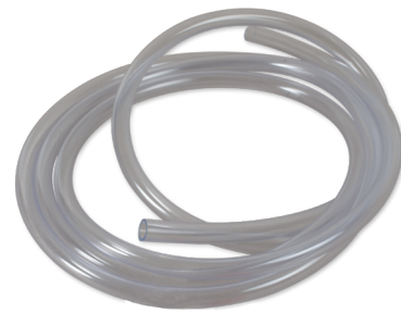
Piston Plug Flexible Extension Tubing

1. Tubing dimensions: inner diameter 3/8", outer diameter 1/2".