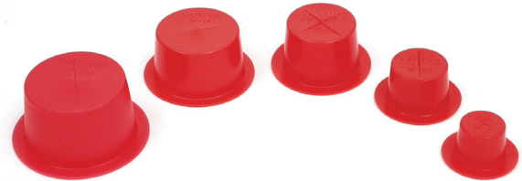
Adhesive Retaining Caps

Adhesive retaining caps make overhead and horizontal installation easier by preventing the adhesive from running out of the hole. They also center the rod in the hole, making them ideal for applications where precise anchor placement is required. It may be necessary to provide support for the anchor during cure time. Adhesive retaining caps are not designed to support the weight of the anchor in overhead installations. Adhesive retaining caps should be used for horizontal and overhead adhesive installations. ARCs may be used in conjunction with the Piston Plug Delivery system.