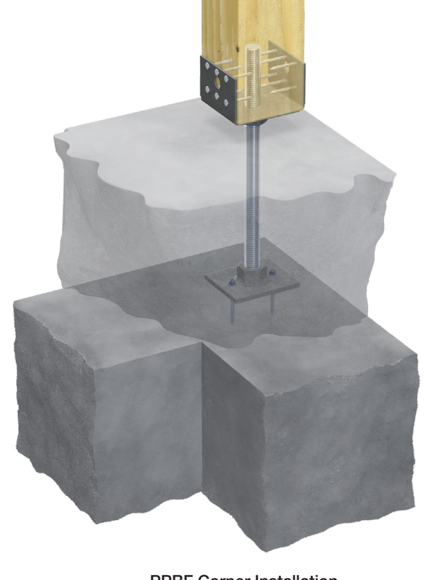
PPBF Corner Installation (After Slab Pour)