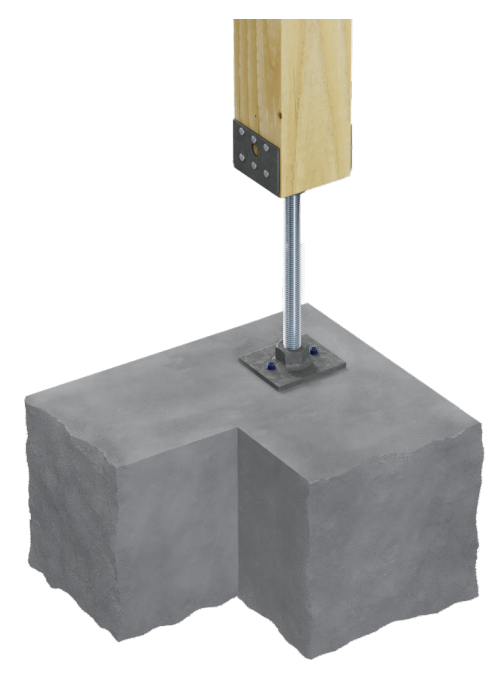
Typical PPBF Installation (Before Slab Pour)